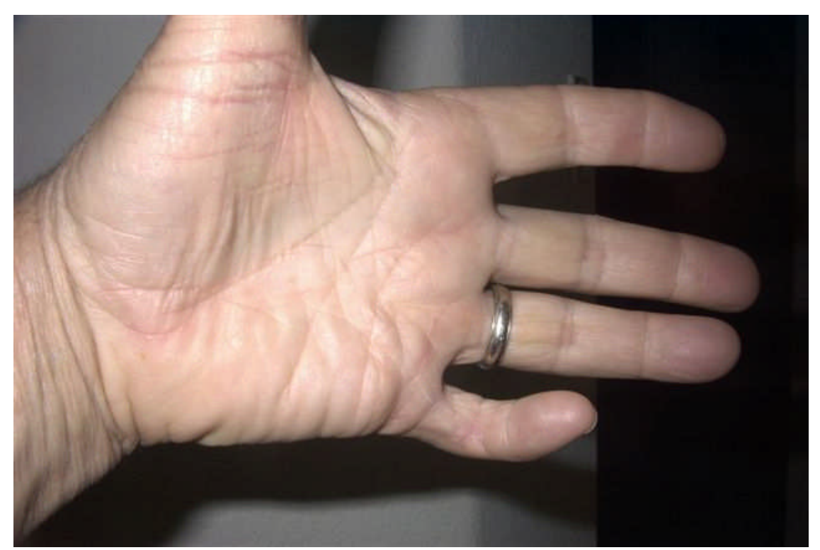
Figure 1. Patient 60 months post McCash incision covered with Apligraf. DASH score 3.3.